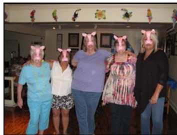
What a Luau! (clockwise from top left) Pig Races, Tiki Bar, Turkey Bowling & Paint Ball.