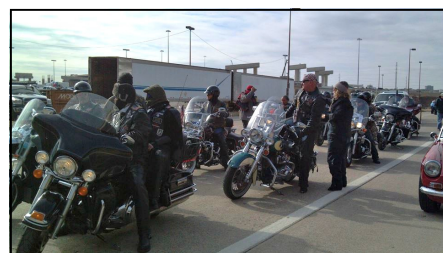
Lining up for the Veterans Day Parade.

On Jan. 10, we will host a Meet and Greet for all District 5