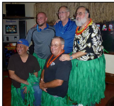
Our Luau hula dancers were a hit!

November kicks off with a pajama event. We are collecting children's PJs for all ages, including young adults (teenagers). This year we will be presenting these PJs to the VA hospital to have on hand for military children. We will place a donation box in the entry way of the Post, so please bring in the PJs by Nov. 29. If you're not a